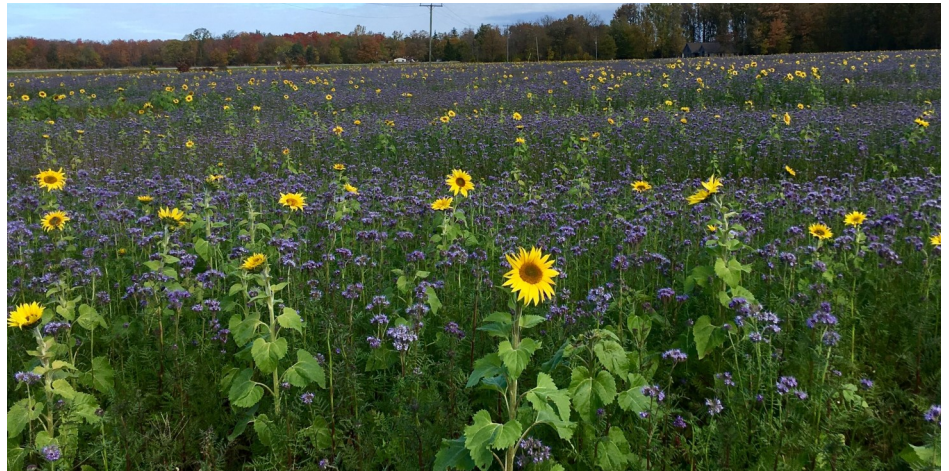
Fall colours: A mix of oats, sunflower and phacelia (Gerard Cornelis Farms)