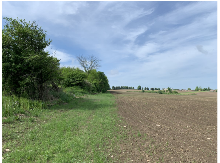
Newly planted grass strip at Huronview Demonstration Farm, which replaced an area beside the bush with consistently poor yields.

Example of a profit map for a farm. The chart shows the proportion of the farm that generated a specific profit per acre.